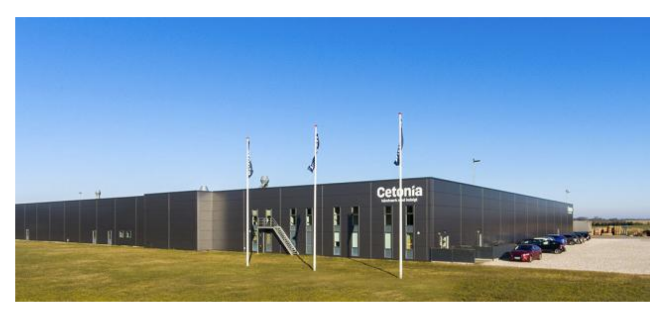
Fig. 1. Cetonia A/S manufacturing plant located in Bjerringbro, Denmark.

Cetonia A/S is a Danish company specialized in the production of wood and aluminum windows and doors for buildings. Its portfolio encompasses wide range of windows, doors for both private and professional costumers in Denmark. Cetonia A/S produces windows and doors which can be built together in many different ways for the costumers individual specifications. The products are manufactured at the production plant in Denmark and then transported to the costumer.